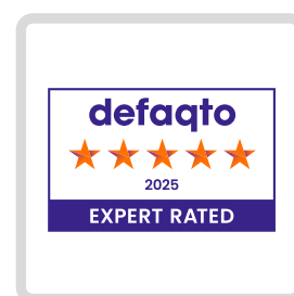
Defaqto 5 Star Rating for Workplace Pension 2025

Our bespoke system was developed and built in-house to be flexible and adaptable. We currently manage assets of more than £20 billion for over 6 million members within The People's Pension.